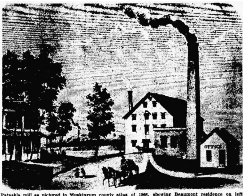
Pataaskia mill as pictured in Muskingum county atlas of 1866, showing Beaumont residence on left.

"U.S. and Canada, Passenger and Immigration Lists Index, 1500s-1900s." Database. Ancestry.com. http://www.ancestry.com : 2016.